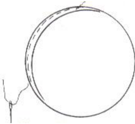
Diagram #3 (describes Step #5, Table Runner)

Diagram #2 (describes Step #5, Table Runner)